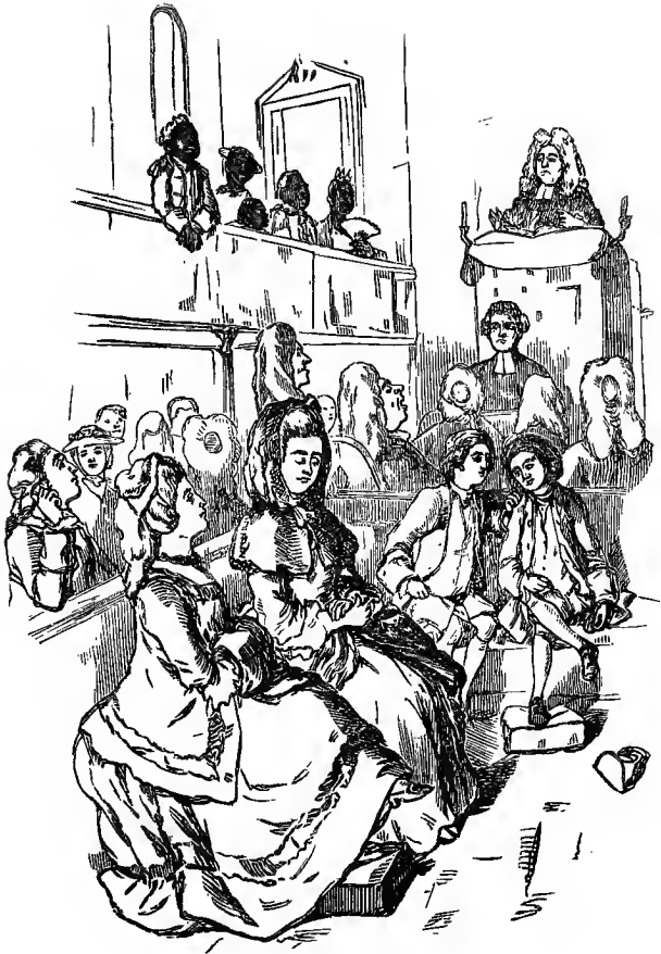
The Family Pew.